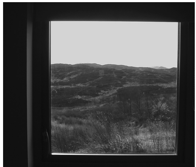
FIGURE 12. Small windows, such as this one in the bedroom at Larch Cottage, are used to frame particular views and create living pictures that have a captivating temporal dimension.

captivating temporal dimension (FIG. 12). Such windows work in a similar manner to Ivon Hitchens’s millpond paintings (Hitchens painted the same scene over and over with a view to gaining a deeper understanding of his immediate environment). Second, there are the large, full-height windows and sliding doors in the main living spaces, which allow a blurring of the horizontal boundary between outside and inside and offer massive, awe-inspiring, and ever-changing panoramas of the highland landscape (FIG. 13). These panoramas are indescribably captivating. I recall seeing a rain squall approaching from afar and a rainbow set against snow-