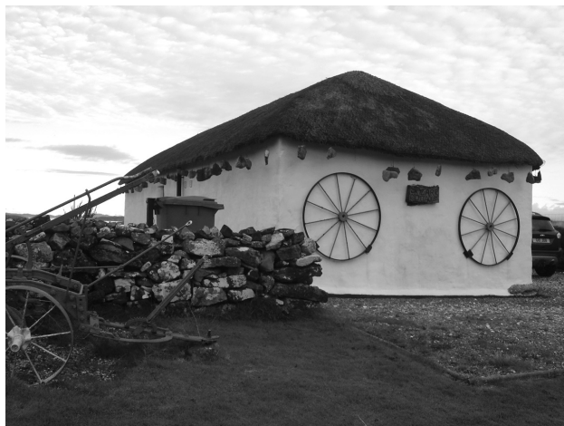
FIGURE 1. Example of a blackhouse reconstructed for the holiday market, Breakish, Isle of Skye.

large-scale sheep farming) (FIG. 2); 17 small one-and-a-half-story, white-painted stone houses with slate roofs dating from the improvement era (eighteenth and nineteenth centuries) (FIG. 3); and white-rendered one-and-a-half-story timber kit houses built in the period since World War II (FIG. 4). However, over the last seventeen years Dualchas Architects, an architectural practice located on the Isle of Skye, have been building dwellings that attempt to reimagine the pre-improvement highland longhouse (blackhouse) (FIG. 5). The case study that follows looks at the ethos of the practice, how this has informed their reimagining of the highland longhouse typology, and how their projects have begun to reorient the domestic market on Skye away from the kit whitehouse.