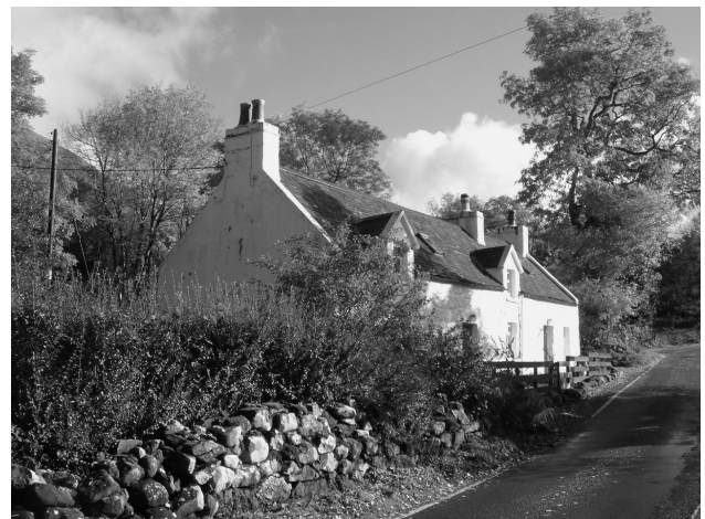
FIGURE 3. Highland improvement “whitehouse,” Torrin, Isle of Skye.