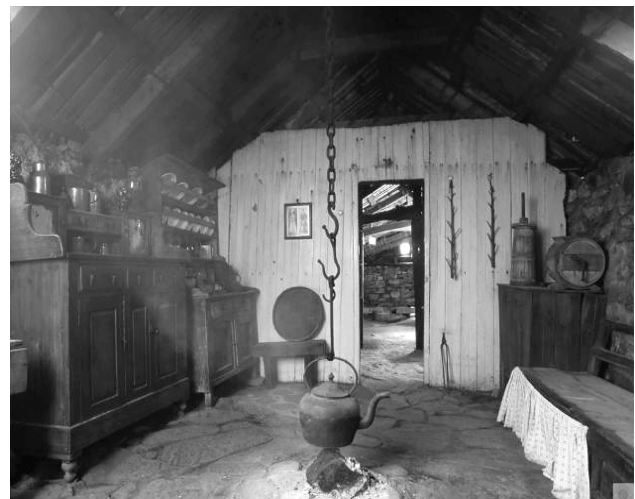
FIGURE 14. Reconstruction of a blackhouse interior at No. 42 Arnol, Lewis (c.1885) (owned by Historic Scotland), showing the single living space with its central peat fire.

The relative stability of the highland clan structure and associated way of life was disrupted in the early eighteenth century when Scotland signed the Union with England (1707) and to all intents and purposes became a colonized land. Scotland’s annexation to England was accompanied by a program of “improvements,” a potent mix of Enlightenment thought from England and Scottish Protestantism. These ultimately led to the systematic destruction of highland life, commonly known as the clearances, and the imposition of new forms of agriculture (large sheep farms), settlement