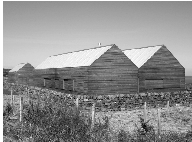
FIGURE 8. The longhouse at Boreraig, designed by Dualchas Architects, keeps the building form low by breaking it up into three separate elements: the living accommodation, the bedrooms wing, and a studio space.

Many of the early longhouses were small and low-cost, designed to attract a Rural Home Ownership Grant. 29 However, as the practice became better known through design awards, publications, and word of mouth, it attracted more prosperous clients, many of whom were successful Gaelic émigrés returning to Skye in hope of reconnecting with their heritage. 30 As a consequence, the architects began to secure commissions with increased budgets, which allowed them to work with sites in more ambitious ways. For instance, the longhouse at Boreraig, completed in 2011 for a Buddhist client who inherited a croft from his mother, kept the building form low by breaking it into three separate elements: the living accom-