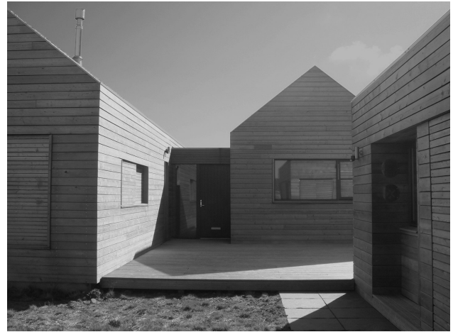
FIGURE 11. Dualchas Architects have increasingly used as-found, or “brut,” materials in their work, as demonstrated by the larch-plank rainscreen on the house at Borerraig.

Two hundred years later Dualchas have harnessed the potential of airtight timber construction and high-performance windows to create longhouses that visually connect the inside and outside without compromising thermal efficiency. These connections come in two distinctive forms. First, there are the small windows that frame particular views — a tree, a mountain, a stream — creating living pictures that have a