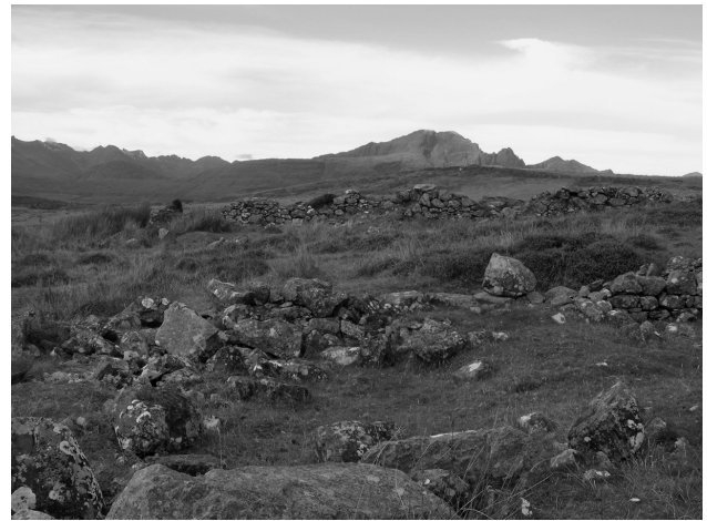
FIGURE 2. Ruins of a pre-improvement highland settlement, Suisnish, Isle of Skye.

The highland environment today is characterized by dramatic mountainous landscapes scattered with a mixture of ruined stone, pre-improvement blackhouses, such as those to be found in the ruins of the village of Suisnish (which was cleared by the Lord McDonald in 1853 to make way for