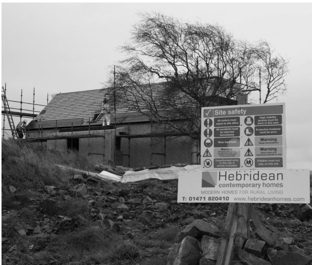
FIGURE 17. An LH102P design taking shape at Kilnaish near Tarbert in Argyll. This is one of the standard house types that forms part of Dualchas Architects' HEBHOMES project. The project aims to provide low-cost housing that continues the longhouse typology.

Their sister company, HEBHOMES, promotes and sells a collection of standard longhouse-inspired designs that may be purchased as self-build kit houses or as complete design-build packages. 41 The designs employ Dualchas's own Structurally Insulated Panel System (SIP), that is constructed off site and can be erected very quickly (within a week) (FIG. 17). Dualchas claims that the SIP system uses up to 50 percent