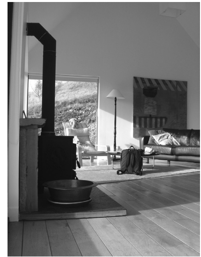
FIGURE 15. Open-plan living spaces, such as the one in the house at Larch Cottage, house a number of functions that would normally be carried out in separate “named” rooms (dining room, kitchen, sitting room, study, etc.). This strategy results in a reduction of the number of rooms and the amount of circulation space needed to support them — therefore also reducing the construction cost.

ported by multiroomed houses. In addition, these generous living spaces, which characteristically rise to the apex of the roof, also reinstate the possibility for holding community gatherings ( céilidh ) — which, as Sarah Macdonald found in her recent study of an isolated community on the Isle of Skye, are still of necessity held in people’s homes. 38