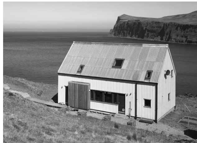
FIGURE 18. House at Milovaig, Isle of Skye, designed by Rural Design Architects.

Collectively, these initiatives appear to represent a paradigm shift in the local conception of domestic architecture, a shift that rejects the "imposed" typology of the whitehouse in favor of a "reimagined" longhouse, and one that results in buildings that sit more gently in the highland landscape and that provide their inhabitants with more economically, socially and culturally relevant dwellings.