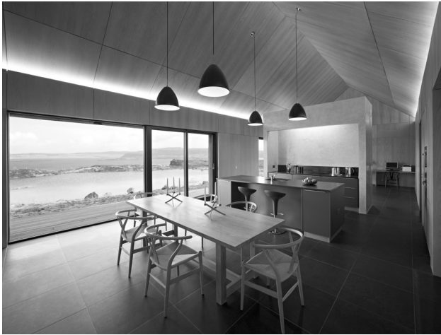
FIGURE 16. The living space in the house at Borerraig is arguably Dualchas's most poetic work. This is architecture whose richly materialist minimalism alludes to Gaelic archetypes.

commitment to serving the island's socially and economically deprived community. 40