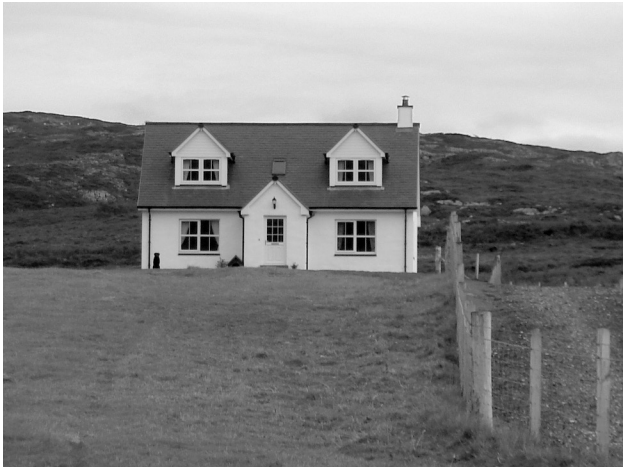
FIGURE 4. Example of the now ubiquitous highland kit house, Kilbride, Isle of Skye.