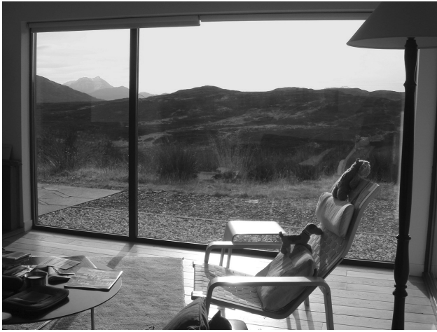
FIGURE 13. Dualchas Architects employ large full-height windows and sliding doors in main living spaces, such as this one at Larch Cottage, to blur the horizontal boundary between outside and inside and offer massive, awe-inspiring, ever changing panoramas of the highland.

covered mountains and dark skies. Such experiences act as a constant visual draw and a humbling reminder of the power and presence of the weather, the mountains, and the sea.