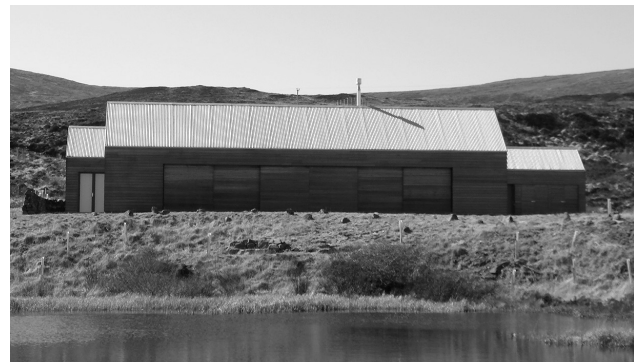
FIGURE 9. Dualchas Architects used a natural bowl in the landscape to form a lochan (small pool or pond) that became the focal point for near views from the longhouse at Boreraig.

Both the above designs evidence a modus operandi that might be termed “constructing the site.” This results in informal collections of buildings that sit gently within the natural contours of the land, but that also manage to create a sense of place in the space loosely bounded by the buildings.