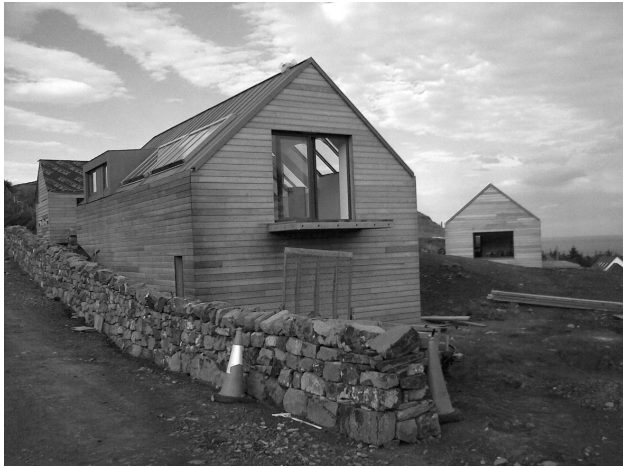
FIGURE 10. The house at Flodigarry split the accommodation into three parts — a dwelling, an outbuilding, and a self-contained flat — and located the accommodation in three different-sized longhouse forms. These were sited on a hillside in positions that both minimized the necessity for earth-moving and optimized the aspect from the main buildings.

In addition to working with the site to minimize the visual impact of its designs, Dualchas have used the materiality of their buildings to reinforce a sense of “belonging,” both in the literal and metaphorical sense of the word. Although some of their early longhouses were finished in white render, evoking the ubiquitous improvement whitehouse, Dualchas have increasingly used as-found, or “brut,” materials, such as local stone for external walls and internal floors, galvanized steel for gutters and ironwork, and larch planks to form rain screens (FIG. 11). 31 The colors and textures of these materials, particularly when weathered, help the longhouses tonally meld with the highland landscape — in a sense reproducing the camouflage effect created by the markings on the highland stag, wildcat or hare.