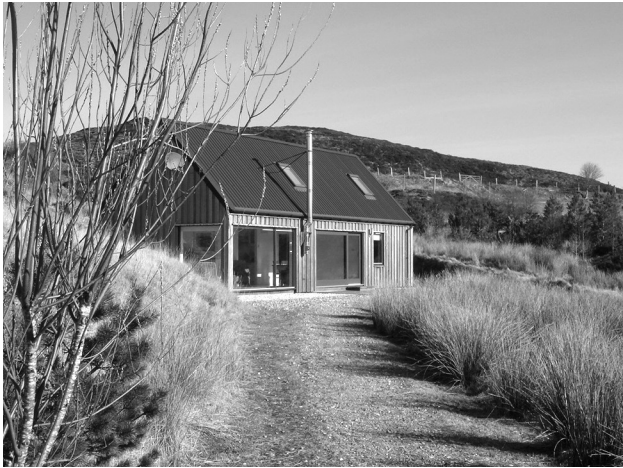
FIGURE 7. Larch Cottage, Drumfearn, Isle of Skye, designed by Mary Arnold Foster of Dualchas Architects, adopts a long, low form that echoes the proportions of the blackhouse, and that is sited carefully in a natural hollow that protects it from the prevailing winds.

used local and often recycled materials for the construction of their blackhouses. 26 However, the Dualchas practice also accepts that the blackhouse remains a symbol of backwardness for many contemporary Gaels, and consequently assert the necessity for “tradition to be an evolving thing” — a reimagining for the contemporary world. 27 But what architectural form could this reimagining take?