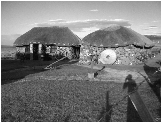
FIGURE 5. The Skye Museum of Island Life at Kilmuir, Isle of Skye, was opened in 1965. The museum preserves a small township of nineteenth-century thatched blackhouses.